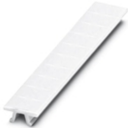
Zack marker strip, 10-section, horizontally labeled with the consecutive numbers: 391 ... 400, white, width: 6 mm

Please be informed that the data shown in this PDF Document is generated from our Online Catalog. Please find the complete data in the user's documentation. Our General Terms of Use for Downloads are valid ( http://phoenixcontact.com/download )